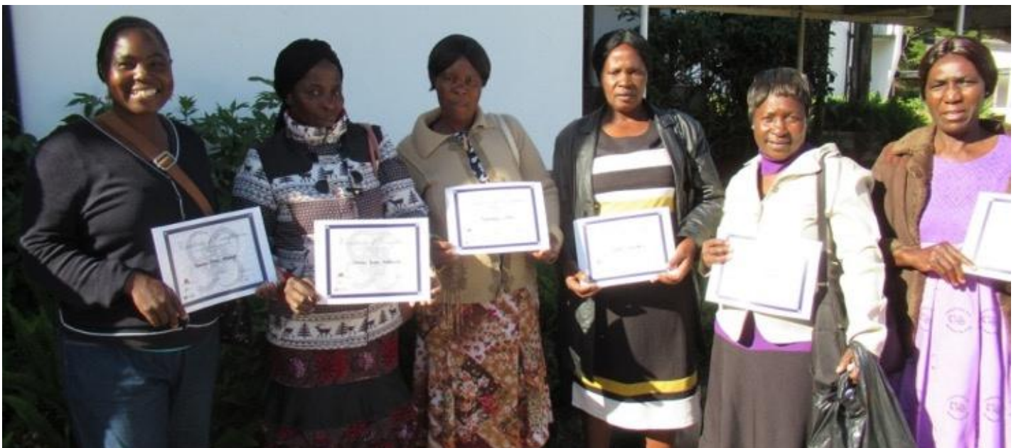
FCH Mothers at Sensory Processing and Integration Seminar