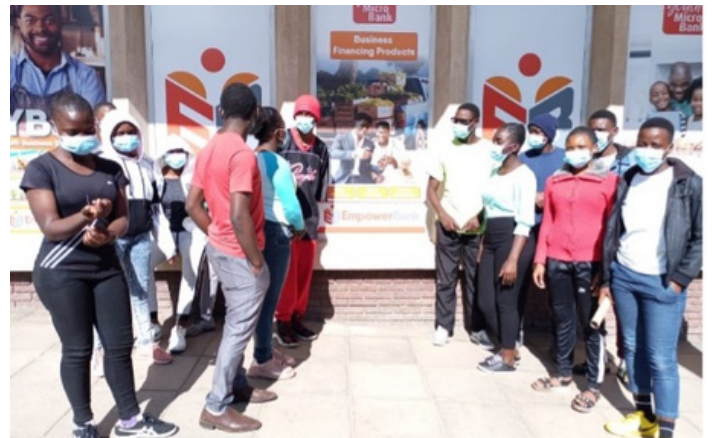
Children at EmpowerBank

The children have been very receptive to the program and are very grateful for these sessions. We are still in contact with some of the children who have left the home and are now in tertiary institutions. The impact of this program cannot be quantified, it goes beyond figures. It is life transforming. We would like to thank FOSA and the administration for supporting this initiative. These children are all our children, and we have a responsibility towards them. There is an African Proverb that says, "it takes a village to raise a child" and this is so true when we look at the story of the Fairfield Children's Homes. Thanks to all of you, there is Hope for these children after the home.