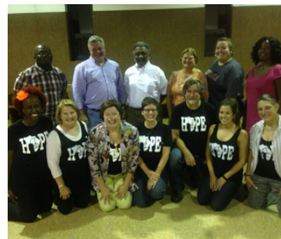
2013 Board Retreat Hosted in Chicago, Illinois

Every Fall the FOSA Board travels to a single destination to meet for an annual Board Meeting. This event marks the one time each year we are all together to share updates and create a strategic plan for the upcoming year. Every Board Member pays their own way, including transportation, sleeping accommodations, and food while at the retreat. Taking place in a new city each year, the retreat is most often hosted by a local Board Member who helps coordinate the logistics and provide local insight for the team. This year, we will be meeting in the Music Capital of America, Nashville, Tennessee!